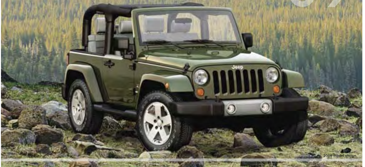
2008 model shown.

2009 JEEP WRANGLER • 2009 JEEP WRANGLER • 2009 JEEP WRANGLER • 2009 JEEP WRANGLER • 2009 JEEP WRANGLER • 2009 JEEP WRANGLER • 2009 JEEP WRANGLER •